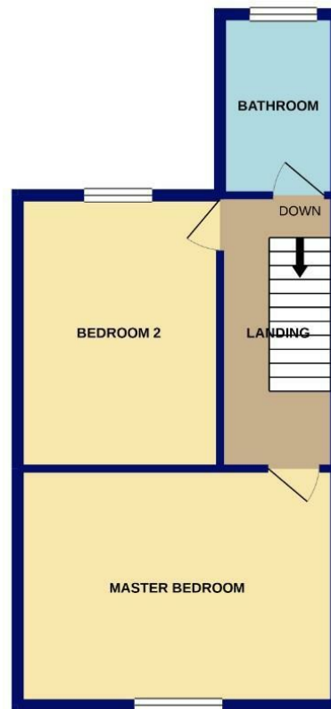
1ST FLOOR 40.5 sq.m. (436 sq.ft.) approx.